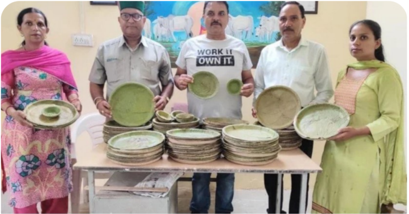
ईको फ्रेंडली डोना-पत्तल।